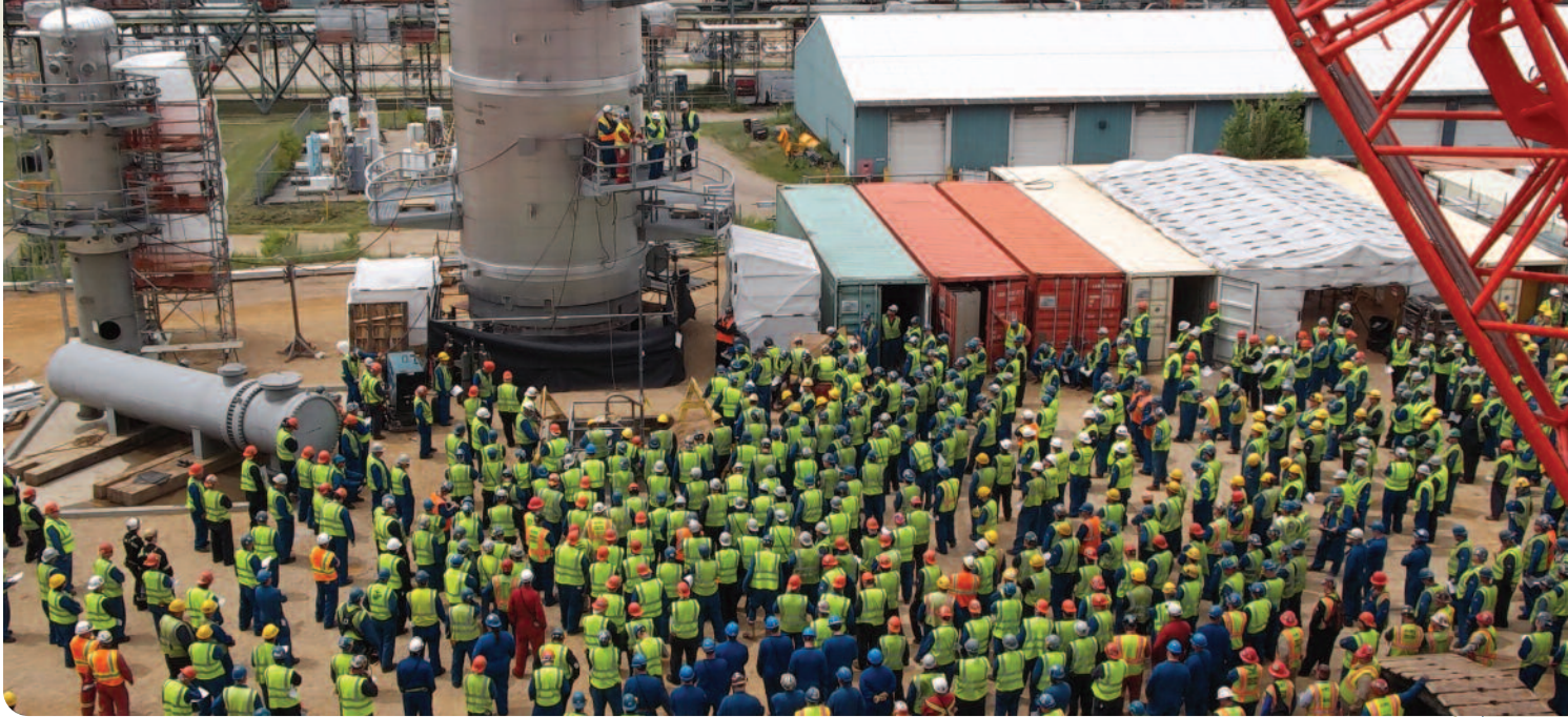
Pine Bend refinery contractors gather in celebration of recently completed work.

Flint Hills Resources is also exploring another technology that would allow the refinery to remove sulfur from gasoline and convert it into a very safe and stable form of liquid fertilizer known as ammonium thiosulfate,