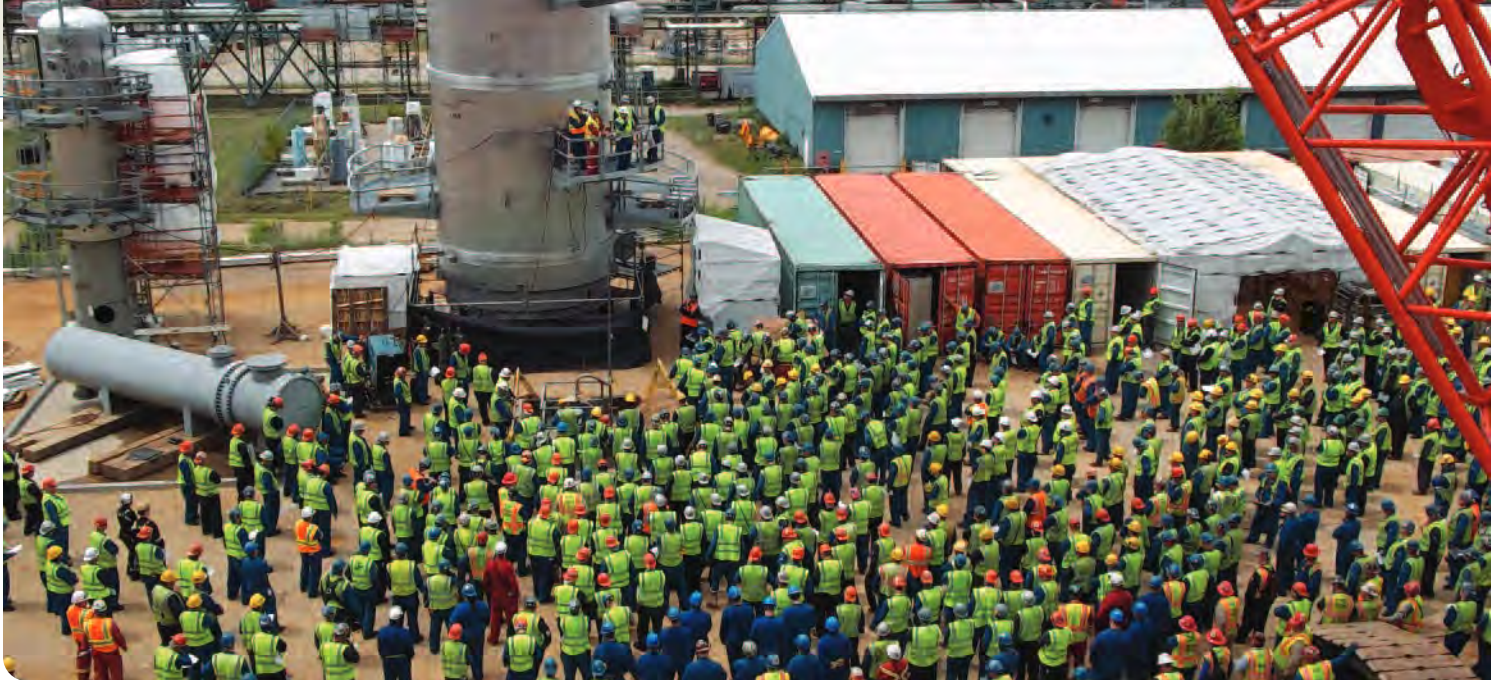
Pine Bend refinery contractors gather in celebration of recently completed work.

Flint Hills Resources is also exploring another technology that would allow the refinery to remove sulfur from gasoline and convert it into a very safe and stable form of liquid fertilizer known as ammonium thiosulfate,