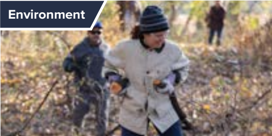
Pine Bend Bluffs restoration