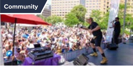
Flint Hills Family Festival