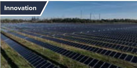
120,000+ solar panel complex